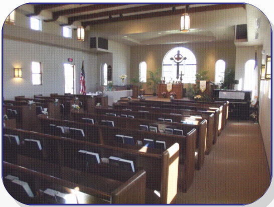
Sanctuary at Black Mountain

Statement of Inclusivity We seek to be inclusive and welcome into the full life and ministry of our church all persons without regard to age, race, gender, sexual orientation, sexual identity, ethnicity, religion, marital status, economic status and personal ability.