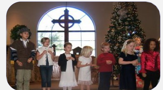
BMUCC Children Perform Advent Play

We pray for the continued guidance and inspiration of the Holy Spirit as we move ahead seeking God's plan for all of us.